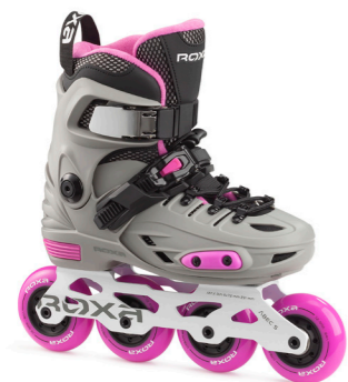
LT. GREY/LT. GREY/PINK

SIZES: 1 -> EU 28 - 31 / MP 17.5 - 19.5 2 -> EU 32 - 35 / MP 20.5 - 22 3 -> EU 36 - 39 / MP 22.5 - 25