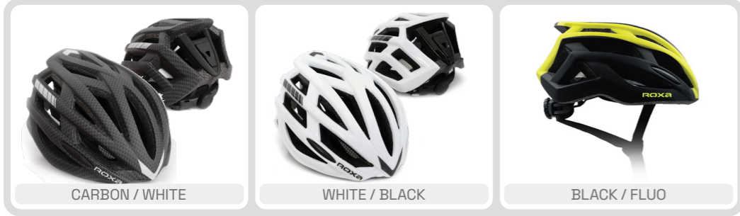
CARBON / WHITE