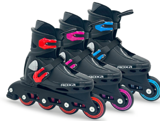
BLACK/RED - BLACK/PINK - BLACK/BLUE