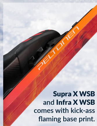
Supra X WSB and Infra X WSB comes with kick-ass flaming base print.

The legendary Peltonen wet snow base remains in collection and is as strong as ever. Must have for serious racers.